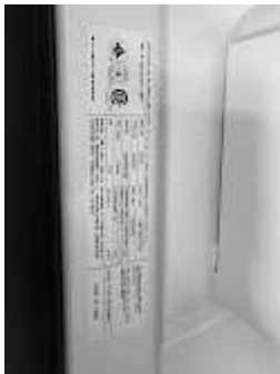
line 1 (2).jpg 201K