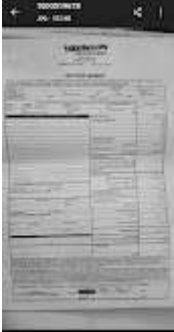
LINE 1 PROOF OF PURCHASE ON FRIDGE.jpeg 905K