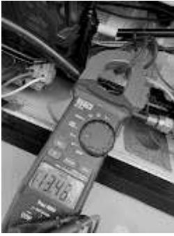
line 1 (1).jpg 410K