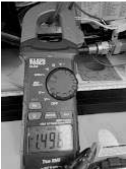
line 1 (4).jpg 534K