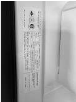
LINE 1.jpg 814K