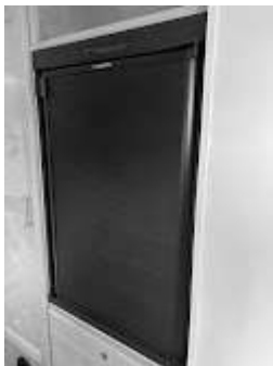
line 1 (3).jpg 278K