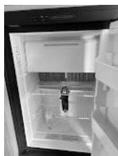
LINE 1 (5.jpg) 260K