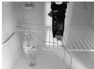
LINE 1 (7.jpg) 223K