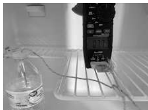
LINE 1 (6.jpg) 240K