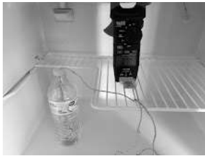
LINE 1 (7.jpg 223K