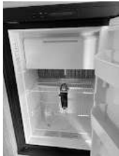
LINE 1 (5.jpg 260K

CustomerSupportCenter <customersupportcenter@dometic.com> To: "ashlee@dealer-advisors.com" <ashlee@dealer-advisors.com>