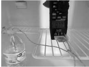
LINE 1 (6.jpg 240K