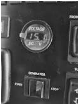
line 2 (3.jpg) 130K