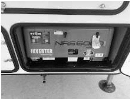
LINE 2 REQUESTED INFO (2.jpg) 609K