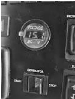
line 2 (3.jpg 130K