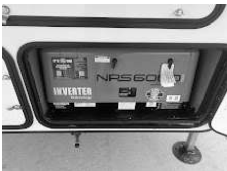
LINE 2 REQUESTED INFO (2.jpg 609K