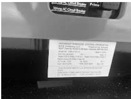
LINE 2 REQUESTED INFO.jpg 396K